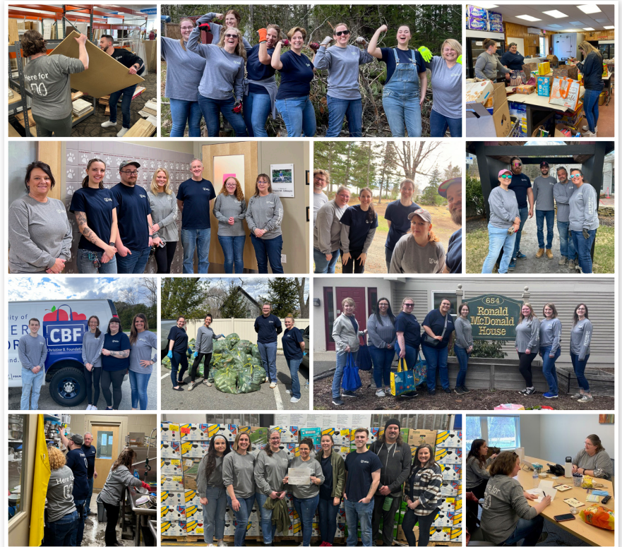
UCU employees spent the day volunteering across the state during UCU's Day of Service on Patriots' Day, 2024.

Here for U - Dedicated to promote financial well-being for you and your community